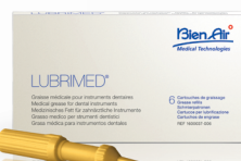
LUBRIMED Pack of 6 cartridges REF. 1600037-006