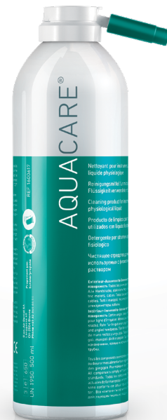
AQUACARE 500 ml cleaning spray Pack of 6 REF. 1600617-006