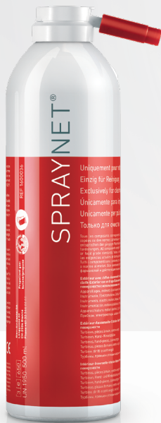
SPRAYNET 500 ml cleaning spray Pack of 6 REF. 1600036-006