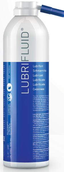
LUBRIFLUID 500 ml lubricant Pack of 6 REF. 1600064-006