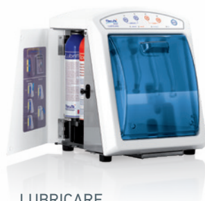
LUBRICARE Maintenance system REF. 1600915-001