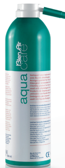
AQUACARE 500 ml cleaning spray Pack of 6 REF. 1600617-006