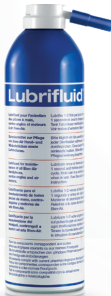
LUBRIFIUID 500 ml lubricant Pack of 6 REF. 1600064-006