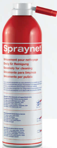
SPRAYNET 500 ml cleaning spray Pack of 6 REF. 1600036-006