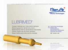
LUBRIMED Pack of 6 cartridges REF. 1600037-006