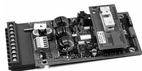
REF 1500518 DMX-B