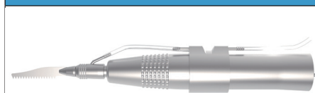
RECIPROCATING MICROSAW REF 1601098-001