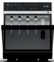
LUBRICARE 2 Maintenance system REF. 1601156-001