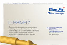
LUBRIMED Pack of 6 cartridges REF. 1600037-006