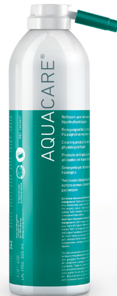
AQUACARE 500 ml cleaning spray Pack of 6 REF. 1600617-006