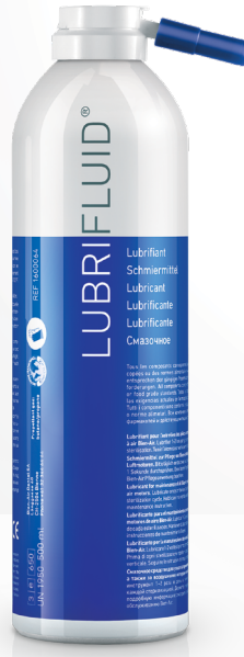
LUBRIFLUID 500 ml lubricant Pack of 6 REF. 1600064-006