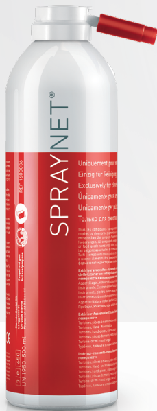
SPRAYNET 500 ml cleaning spray Pack of 6 REF. 1600036-006